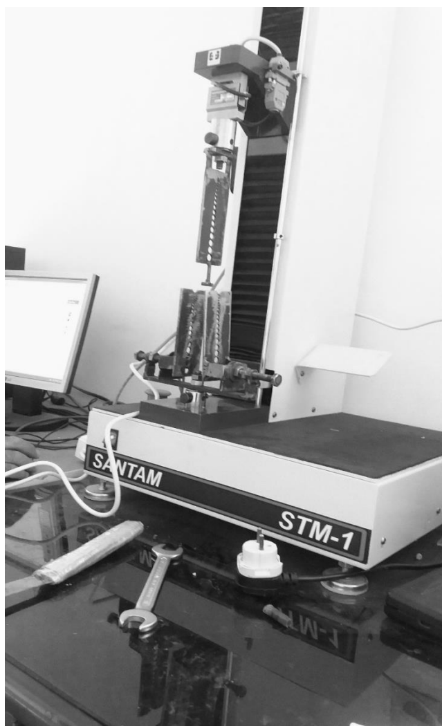
Fig. 2. Measuring bending resistance for evaluation of bending stress and modules of elasticity