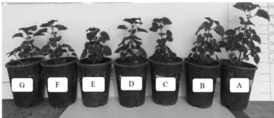
Fig. 4 Comparison of plant height due to the effect of different frequency and duration of vibrating stress after 4 weeks on Coleus plants. A. control, B. 5 min and 7.5 Hz, C. 10 min and 7.5 Hz, D. 5 min and 10 Hz, E. 10 min and 10 Hz, F. 5 min and 12.5 Hz, G. 10 min and 12.5 Hz.