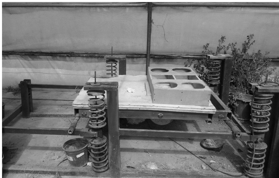
Fig. 1. The vibration simulator device used in the present experiment for applying mechanical stress